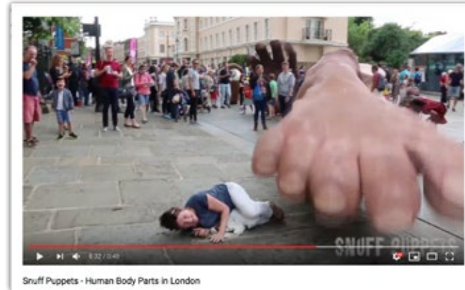
Human Body Parts in London 60 Million YouTube views in 2019