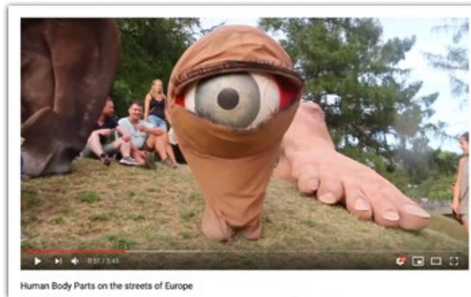
Human Body Parts On The Streets Of Europe 8 Million YouTube views in 2019