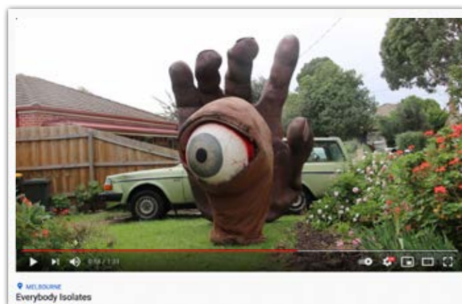
Everybody Isolates 30 Million YouTube views in 2020