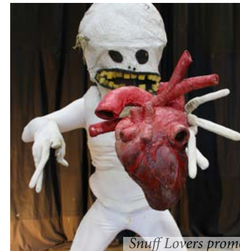
Snuff Lovers promo