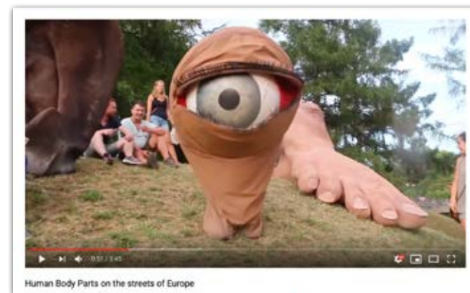
Human Body Parts On The Streets Of Europe 2 Million YouTube views in 2020