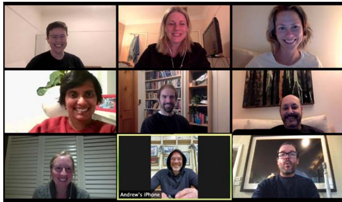
Snuff Puppets board meeting