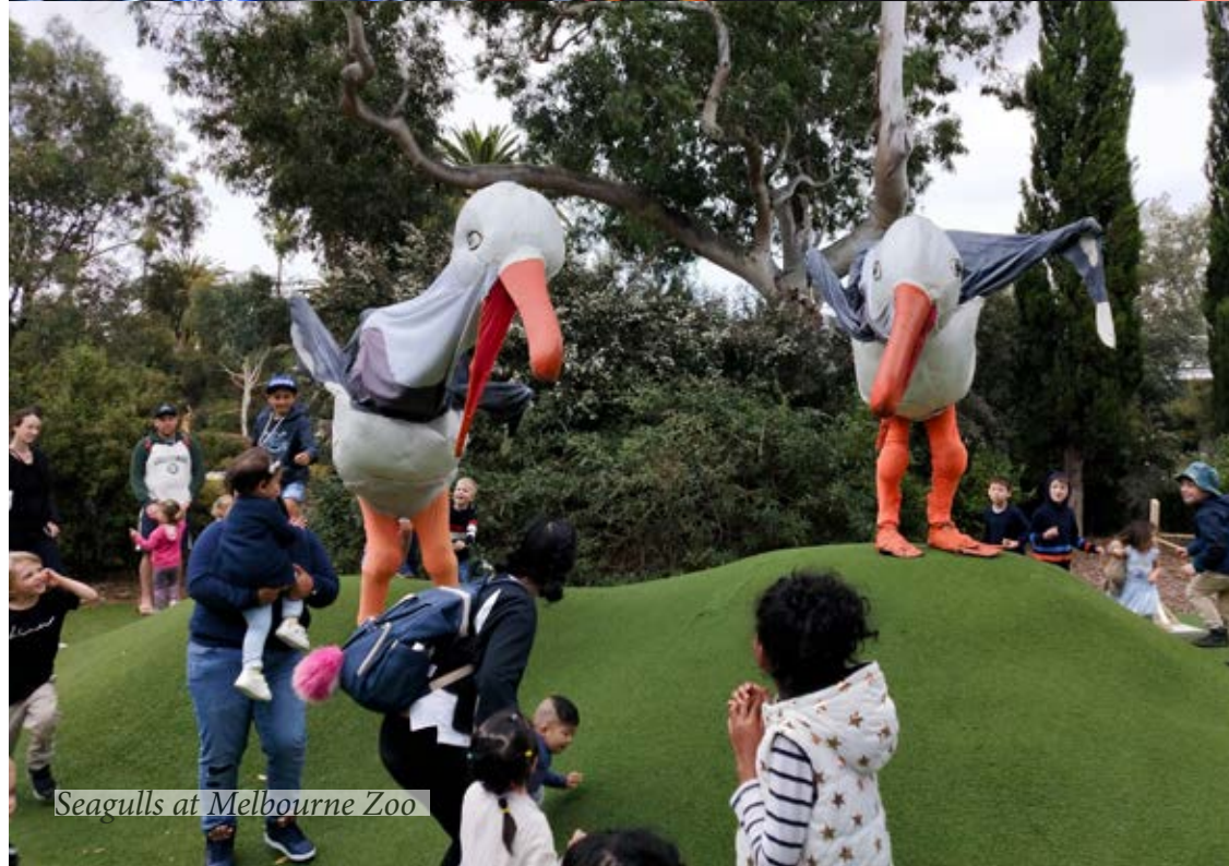
Seagulls at Melbourne Zoo