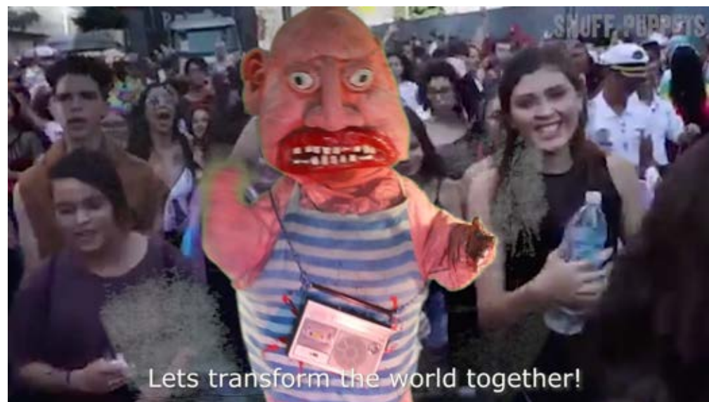
Snuff Lovers promo video

Snuff Puppets are deliberately anarchic, rebellious and dangerous. Our work tackles difficult, awkward and taboo topics that challenge our audiences with irreverence; simultaneously causing discomfort and delight. We deliver visceral, electric performances that blur the traditional lines between audience and performer; creating other worlds that are unfamiliar, uncomfortable and,