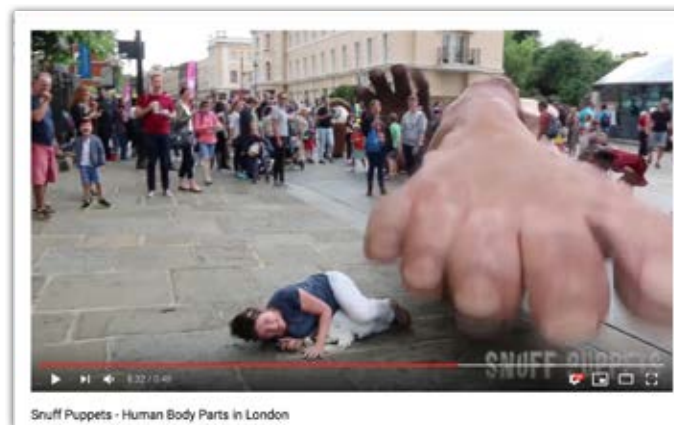
Human Body Parts in London 56 Million YouTube views in 2020