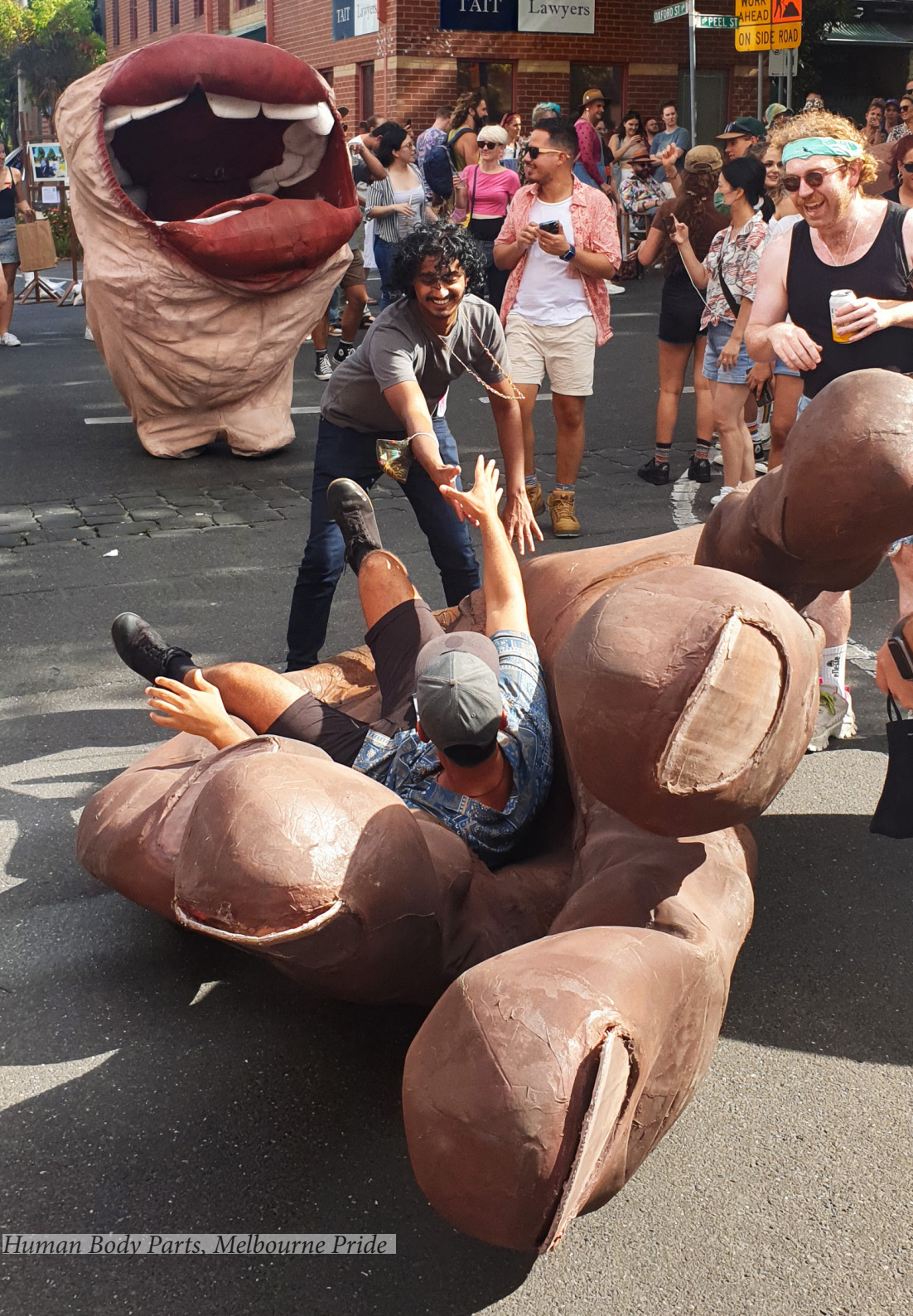
Human Body Parts, Melbourne Pride