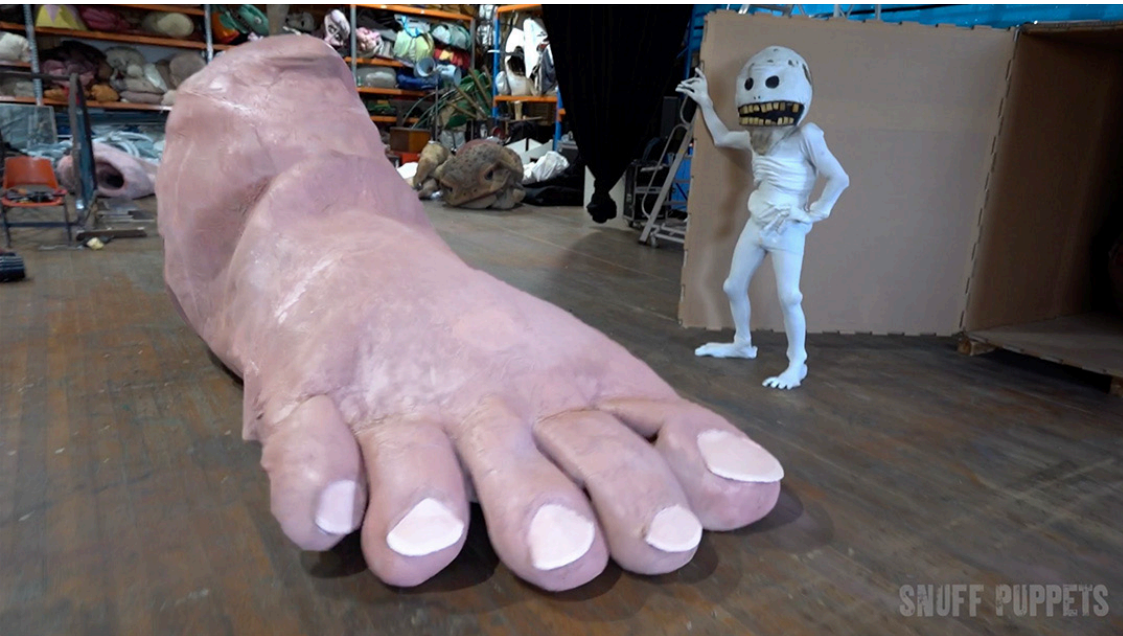
Three Million+ Views: ‘Human Body Parts Leave Melbourne’ video