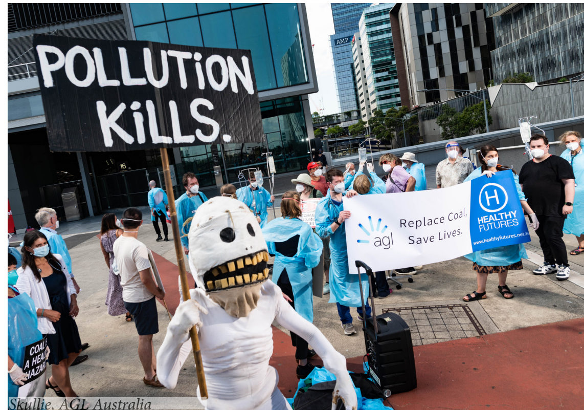
Skully, AGL Australia

Skully joined a mass "die-in" of medical workers from Healthy Futures outside AGL Australia HQ calling for more ambitious carbon transition plans.