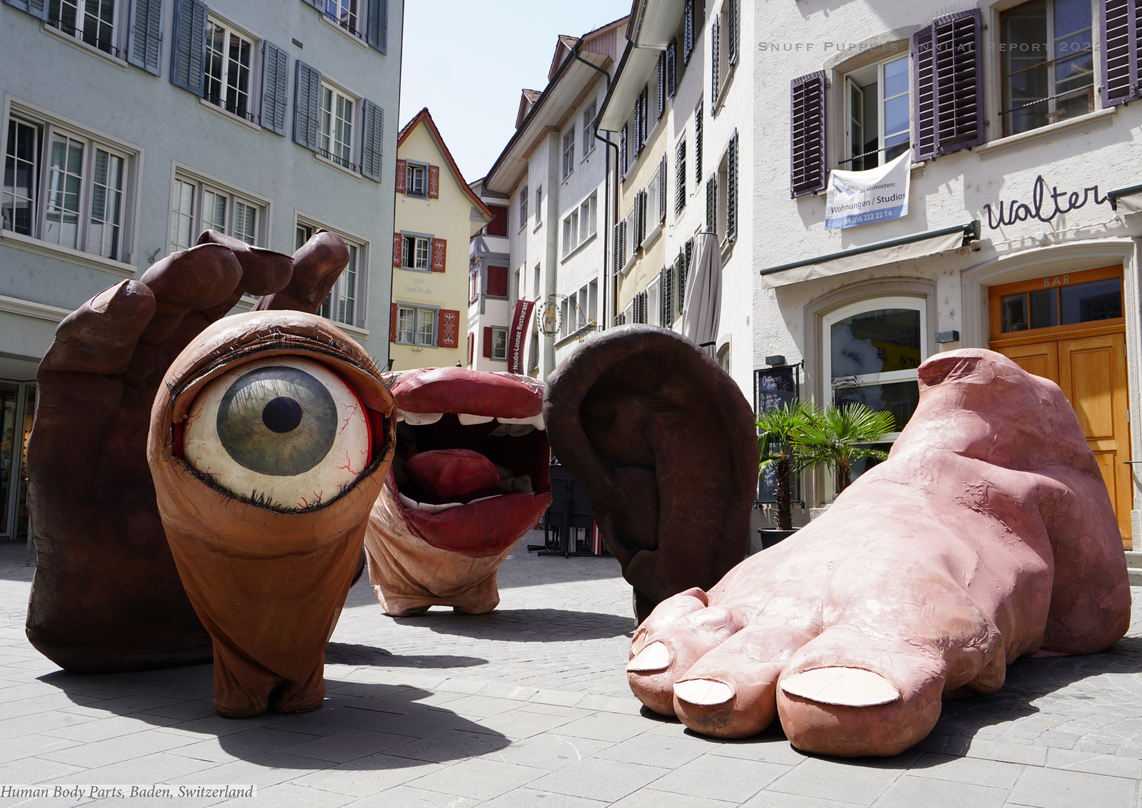
Human Body Parts, Baden, Switzerland