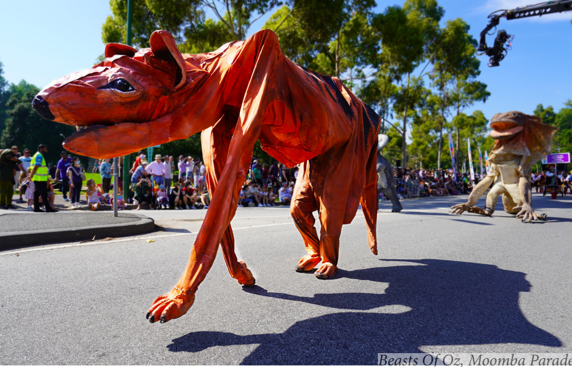
Beasts Of Oz, Moomba Parade

WE HONOUR AND RESPECT ABORIGINAL AND TORRES STRAIT ISLANDER PEOPLE AS THE TRADITIONAL CUSTODIANS OF COUNTRY. ALWAYS WAS, ALWAYS WILL BE ABORIGINAL LAND.