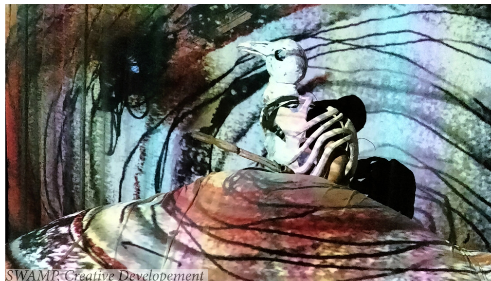
SWAMP, Creative Development

Snuff Puppets are deliberately anarchic, rebellious and dangerous. Our work tackles difficult, awkward and taboo topics that challenge our audiences with irreverence; simultaneously causing discomfort and delight. We deliver